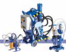
MOBILE FILTRATION UNITS