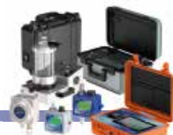
CONTAMINATION CONTROL SOLUTIONS